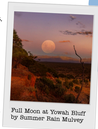
Full Moon at Yowah Bluff by Summer Rain Mulvey

www.cunnamullatourism.com.au/whats-on/photo-competition