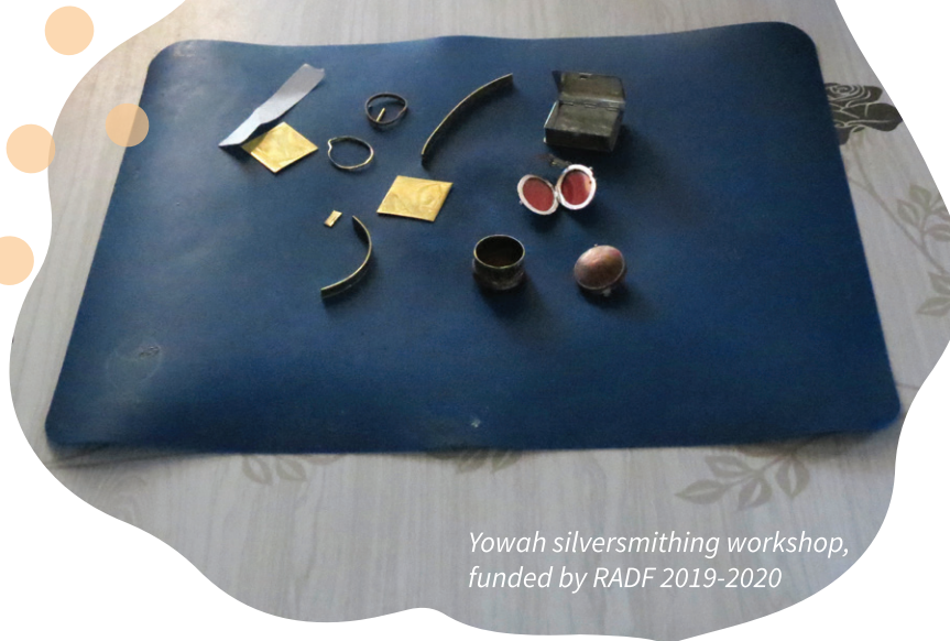
Yowah silversmithing workshop, funded by RADF 2019-2020

Sometimes circumstances change and you cannot carry out your activity exactly as described in your application. When this happens, you MUST :