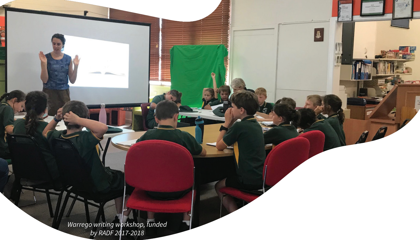
Warrego writing workshop, funded by RADF 2017-2018