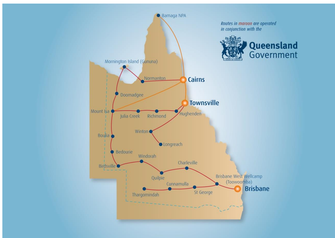
Figure 1 – Queensland Network Map

Funded by Commonwealth Government - Subject to Approval