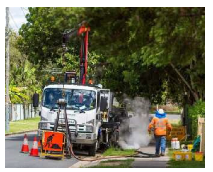
Abergeldie uses steam to cure a new liner in a section of pipeline.

Council appoints contractors as they have the specialist equipment, skills and experience required to deliver the works.